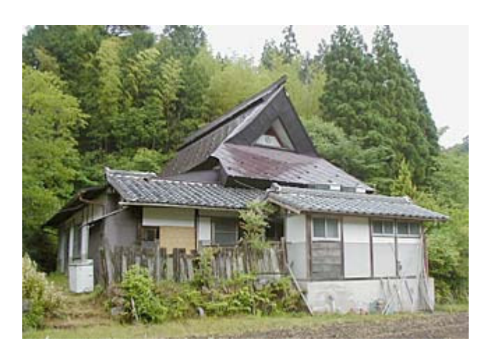
Care Of: http://journeytoforever.org/

We're living in a 100-year-old traditional farmhouse in a rural village up in the mountains near Kyoto, with farming land and workshops, we're much involved in on-the-ground sustainability, Appropriate Technology and biofuels projects here and elsewhere in Japan. We're giving all our technology and resources a final, real-world test-run, finding and filling in the gaps, adapting what needs adapting, developing what's missing. When we're ready, we'll leave, and the Journey-proper will begin.